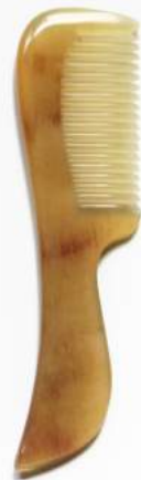
Mustache Comb $48.00